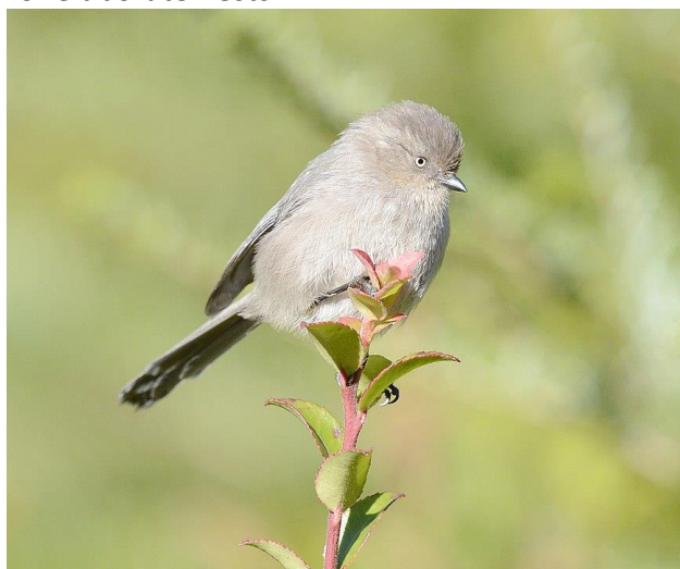
Bushtit by VJAnderson - Own work, CC BY-SA 4.0

Evolution and chance can certainly lead to some odd outcomes. So it is we have two little songbirds native to our area which are the sole New World representatives of their respective Old World families—the Bushtit ( Psaltriparus minimus ) and the Verdin ( Auriparus flaviceps ). What these two errant and only distantly related species also share in common is a diminutive body size, sedentary habits and the construction of elaborate nests.